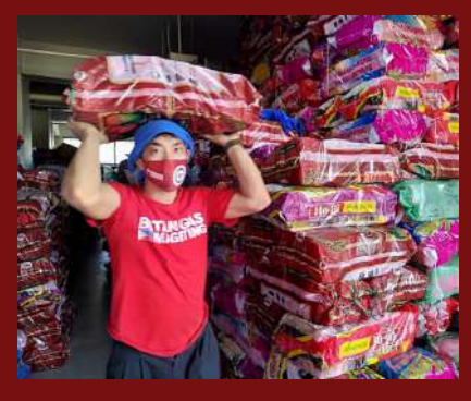
SCPC AT SLPGC, KAISA NG BATANGAS LGU SA PAGSUGPO Kontra Covid-19 Pahina 8

In the spirit of bayanihan, SCPC and SLPGC provided P20,000 worth of groceries to the "community pantry" in Calaca, Batangas. The act of goodwill was initiated by the Calaca Bureau of Fire Protection and Community Rescue Volunteers.